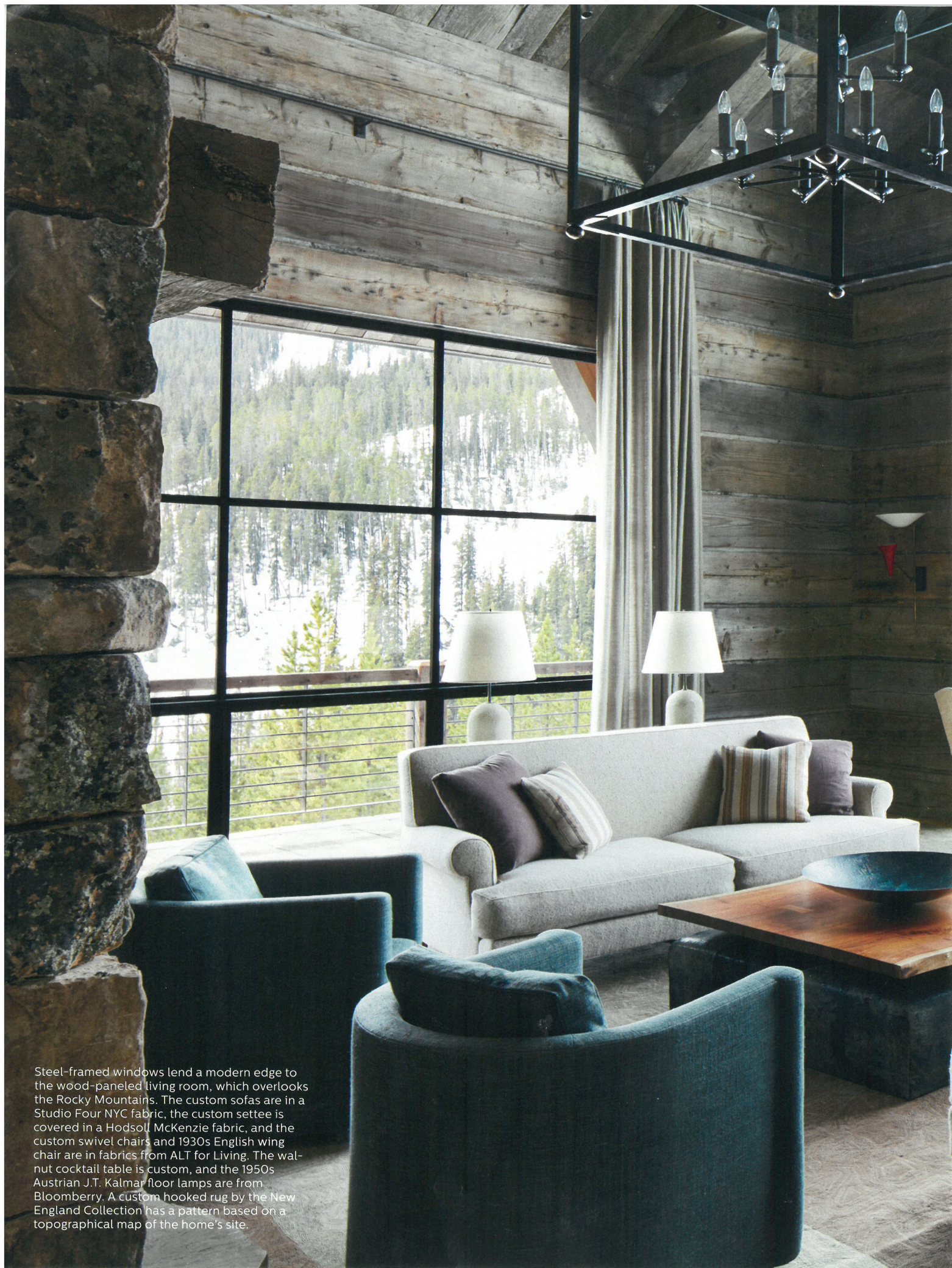
Steel-framed windows lend a modern edge to the wood-paneled living room, which overlooks the Rocky Mountains. The custom sofas are in a Studio Four NYC fabric, the custom settee is covered in a Hodsoll McKenzie fabric, and the custom swivel chairs and 1930s English wing chair are in fabrics from ALT for Living. The walnut cocktail table is custom, and the 1950s Austrian J.T. Kalmar floor lamps are from Bloomberry. A custom hooked rug by the New England Collection has a pattern based on a topographical map of the home's site.