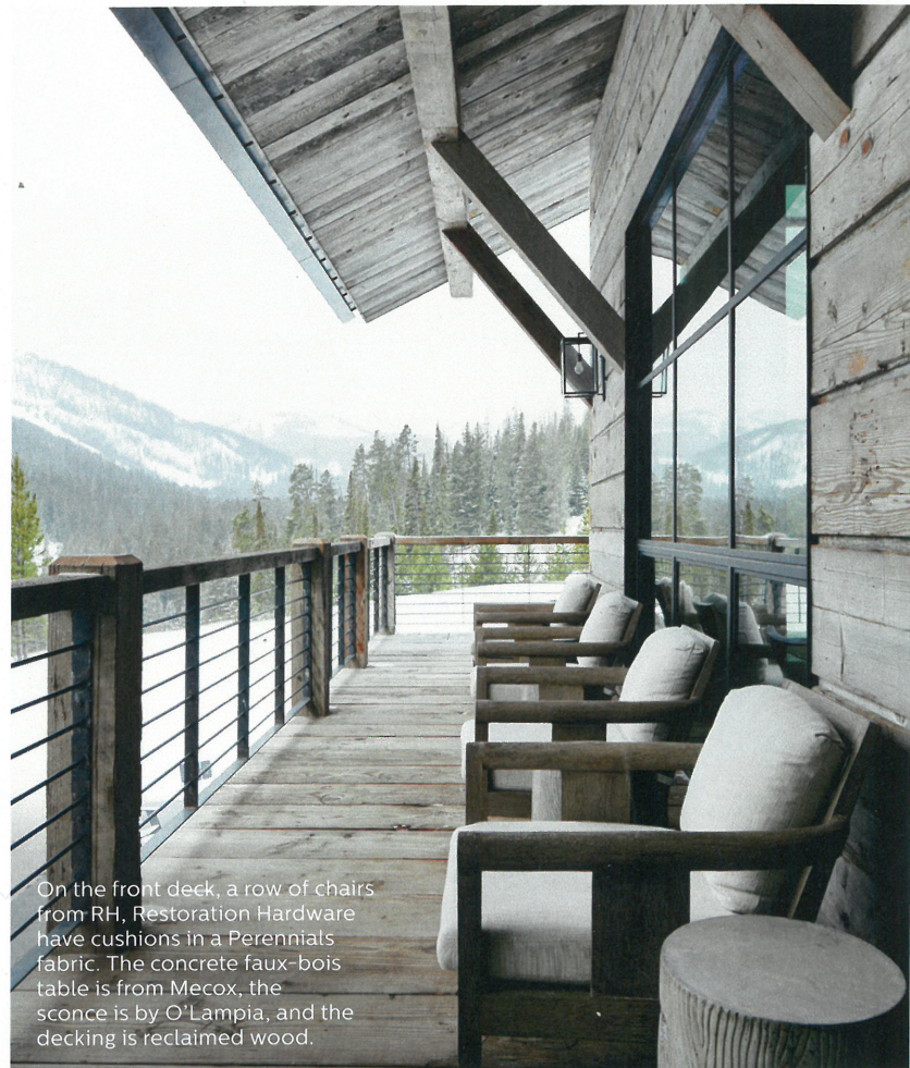
On the front deck, a row of chairs from RH, Restoration Hardware have cushions in a Perennials fabric. The concrete faux-bois table is from Mecox, the sconce is by O'Lampia, and the decking is reclaimed wood.