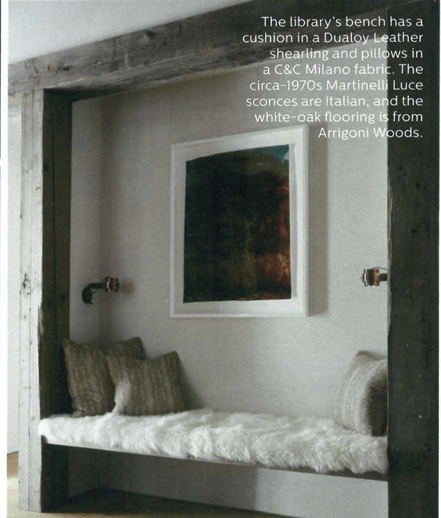
The library's bench has a cushion in a Dualoy Leather shearling and pillows in a C&C Milano fabric. The circa-1970s Martinelli Luce sconces are Italian, and the white-oak flooring is from Arrigoni Woods.