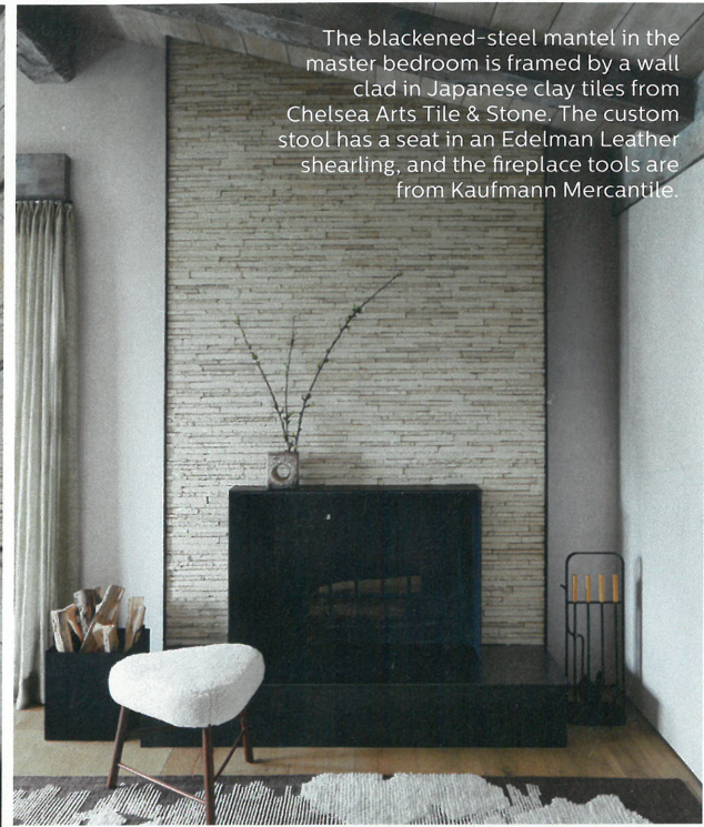
The blackened-steel mantel in the master bedroom is framed by a wall clad in Japanese clay tiles from Chelsea Arts Tile & Stone. The custom stool has a seat in an Edelman Leather shearling, and the fireplace tools are from Kaufmann Mercantile.